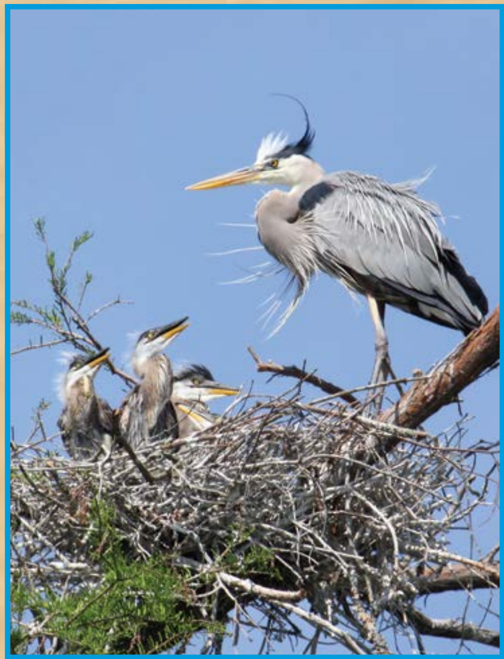
Great blue heror

Cypress-tupelo lakes and sloughs provide excellent opportunities to see wildlife. Watch for nesting herons in spring – along with migrating songbirds and listen for gobbling wild turkeys. This area is rich in reptile and amphibian life, from