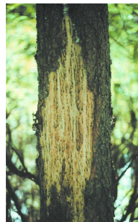
Figure 4. Bear sign on log and tree trunk.