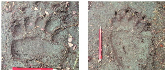
Figure 3. Bear paw prints. Forepaw (left), hindpaw (right).

Without actually seeing bears, you can determine if bears have been in a particular area by the sign they leave behind. Paw prints in mud or sand are relatively easy to identify. The toe pads on the forepaw of a black bear form an arch over the much larger footpad (Figure 3). The hindpaw print, which can be as much as 9 inches long, resembles a human footprint.