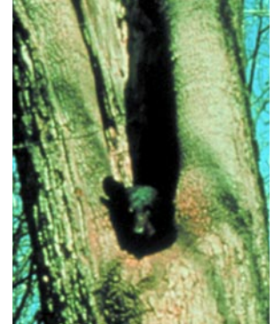
Figure 1. The American black bear in a tree and in its den at the White River National Wildlife Refuge.

Where are black bears in Arkansas? How can I manage my land for black bears? What should I do if I see a black bear? How can I prevent or reduce damage caused by black bears to my property, crops or livestock? This fact sheet focuses on these questions about black bears in Arkansas.