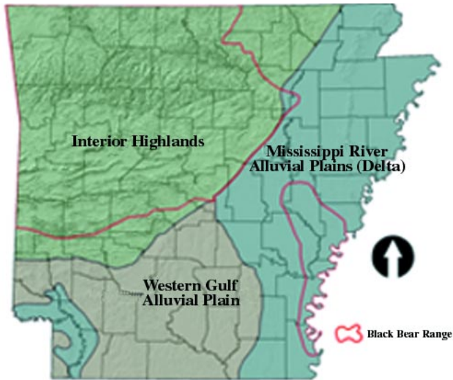
Figure 2. The physiographic regions of Arkansas and black bear range. Paul Medley

Although black bears are difficult to count in forested habitats, the black bear population in Arkansas is currently estimated at over 3,000 animals. Black bears are prized game animals. About 200 are legally harvested annually in Arkansas. Besides using the fur, bear meat is considered highly palatable by many wild-game fanciers. Black bear hunting license and harvest information can be found at www.agfc.com or contact your local Arkansas Game and Fish Commission office.