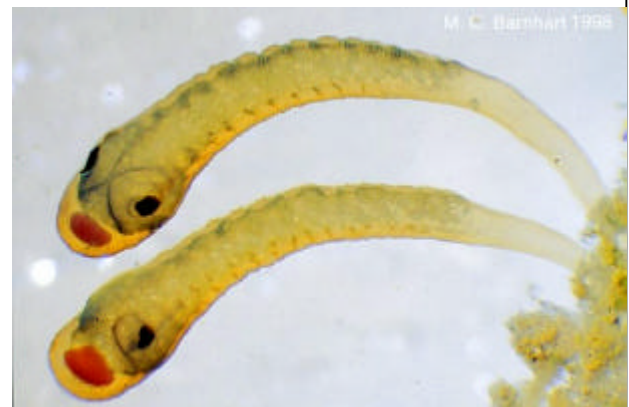
Conglutinates resembling larval fish.

Others don't use lures attached to their bodies but will expel the glochidia in packets called conglutinates. These can resemble larval fish, aquatic insects or nothing at all.