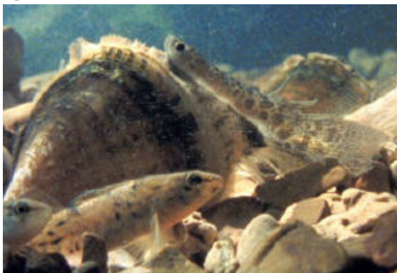
Arkansas broken ray mussel with lure extended

The adaptations these species use to attract host fish are absolutely amazing considering mussels don't even have eyes to see what they are mimicking! The time of year freshwater mussels "go fishing" varies by species and takes place throughout the year. The part of the mussels used for mimicry is the mantle, the part of a mussel that envelops the mussel inside the shell. Several species have an extra bit of mantle that when protruded from the shell, resembles many different things. The Arkansas broken ray mussel's mantle flaps resemble a fish.