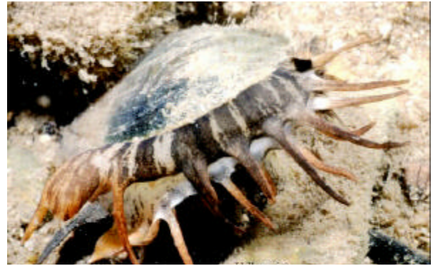
Rainbow mussel with projections extended.

The rainbow mussel utilizes her siphons in her mimicry and extends small projections that some would say resemble alive worms. Others say that if the animal is viewed displaying alive, the lure resembles a crayfish.