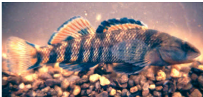
Rainbow Darter ( Etheostoma caeruleum )

The darters have drawn the bulk of attention when it comes to color in our streams, with names such as rainbow, orangethroat, redfin, yellowcheek, greenside, harlequin, and goldstripe. Indeed, darters have