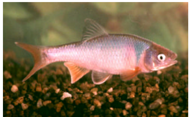
Red Shiner ( Cyprinella lutrensis )

such fantail darters, lay their eggs in nests that are guarded by the male until the eggs hatch!