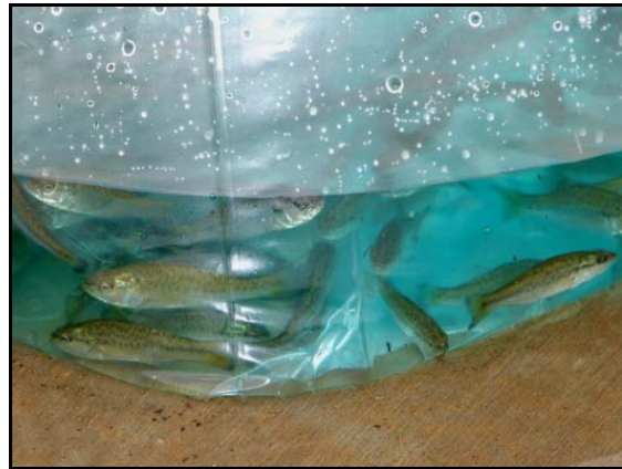
Some of the 115K LMB fingerlings bagged up and ready to be distributed by anglers

On Friday, the first day of the tournament, AGFC personnel and ABA members began bagging up fingerlings in oxygenated bags for the tournament anglers to take out and stock into areas of good habitat throughout the entire river system. Each truck was loaded with approximately 20,000 fish and the fingerlings that were not taken out by the anglers were stocked with the days tournament catch at pre-determined locations into the river.