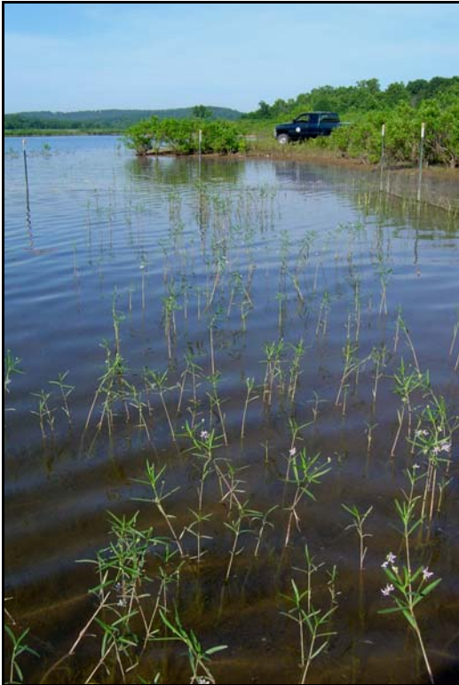
Water willow spreading in large pen at Bull Shoals

The BBP was able to begin planting in June again this year which should allow for another good growing season for our plants on Bull Shoals and Greeson. We were able to take approximately 1,000 plants to Bull Shoals and plant them in our larger pens that we built in the Fall of 2005. We also observed plants growing and spreading from our 2005 plantings.