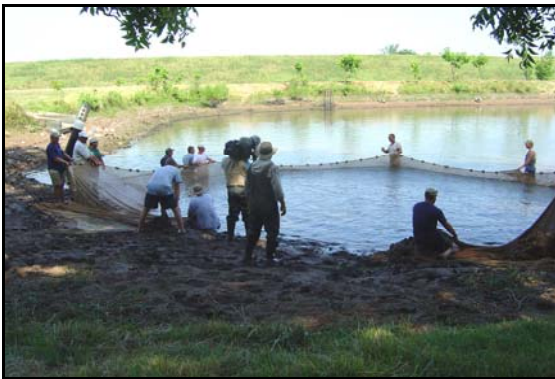
ESPN filming prisoners, ABA members, and Lonoke hatchery staff seining bass from the Cummins Nursery pond

The annual Ford Dealers Big Bass Bonanza (FDBBB) on the Arkansas River was a big event for anglers in more ways than one this year. In addition to possibly winning over $100K, anglers also had the opportunity to assist the AGFC with boat stocking over 100K largemouth bass fingerlings along the entire stretch of the Arkansas River.