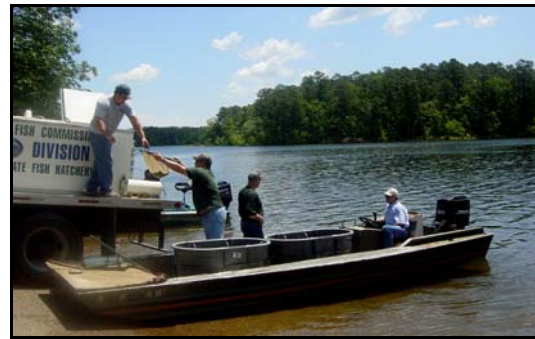
Anglers assisting with FLMB stocking @ DeGray

with good habitat. A total of 227,000 smallmouth were stocked this year! We will continue to strive for our stocking goal of 100K+ SMB fingerlings each year for the next several years in an effort to create a viable SMB fishery in Lake Ouachita.