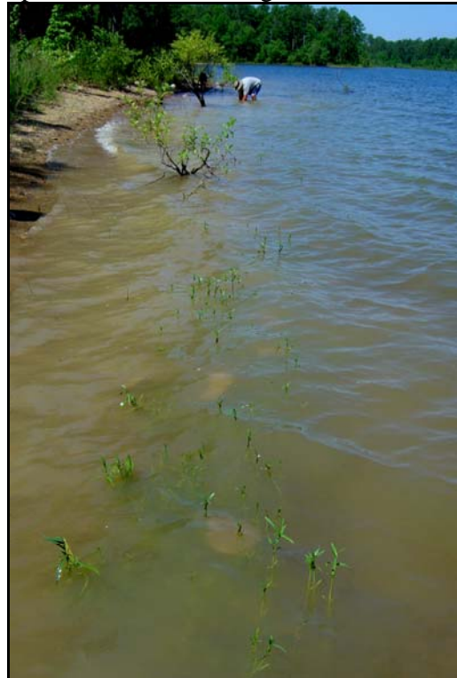
Water willow cuttings taking root at Greeson!

The BBP tried a new technique for establishing water willow on Lake Greeson and Greers Ferry this spring. The new technique involves taking water willow cuttings and laying them out in shallow water while rolling wire over the top of them and weighing down the fencing with rocks. The water willow is stimulated to produce roots at its nodes where it had been cut and it will quickly root into the substrate. On Lake Greeson, after only two and a half weeks, the plants had started growing upward and were doing well.