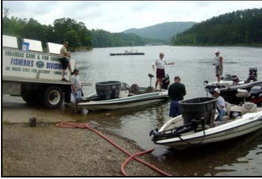
ABBC members ready to stock LMB @ Ouachita

The ABBC also helped us stock largemouth bass fingerlings from the Joe Hogan hatchery at Lonoke into Lake Ouachita. The fish were stocked out of Crystal Springs ramp and the ABBC members provided six boats to help us distribute the fish. The total number stocked was approximately 102,000 largemouth fingerlings into Ouachita.