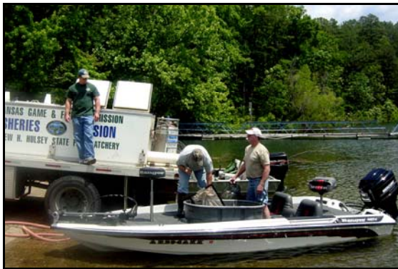
ABBC members assisting with SMB stocking @ Ouachita

I would like to begin this section by saying what a fantastic job our hatcheries have done raising bass this year and harvesting them at the appropriate time to maximize production.