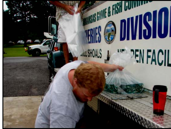
FDBBB Tournament Angler picking up his bag of fingerlings to distribute into the Arkansas River

On Thursday June 22 nd , one day before the tournament began, AGFC personnel along with ABA members and prisoners from the Cummins unit seined the ponds and distributed the fingerlings onto fish hauling trucks that were to be stationed at each of the five tournament weigh-in sites along the river.