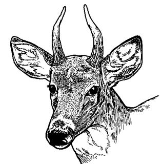
Type B buck