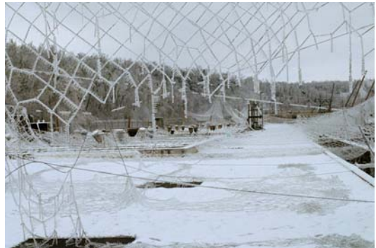
Here the same shot with the net down...