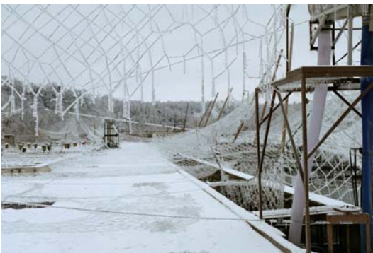
The net over the entire facility was down...

This quarter saw the coming of an arguably unprecedented ice storm which resulted in power outages from several days to weeks here in our area. The hatchery grounds didn't fair very well either as our entire bird netting that covered the premises came down due to all the ice. We're still cleaning up all the limbs and damage done.