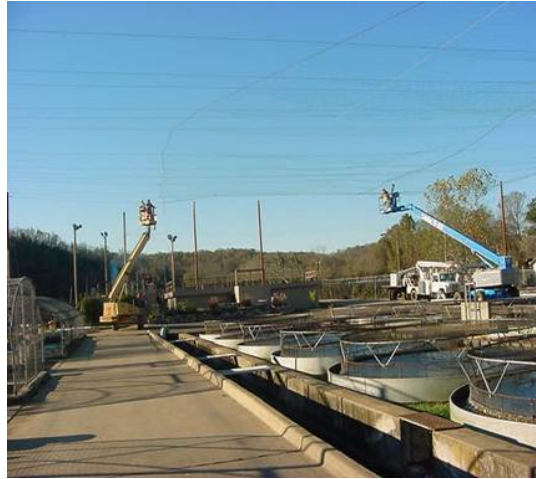
Here's a picture of what the net looked like going up.

It seemed almost every limb around our facility was down. Our crew worked really hard to clean up and get our facility up and operating again. It was just an unprecedented event that we hope we won't see again for a long time. According to the old timers this storm was worse than the ice storm of 1955.