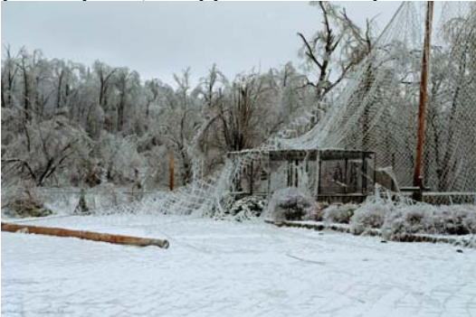
Netting down over our gazebo...

It's hard to put into words what the ice storm we had was like in our neck of the woods. We had around 3 to 4 inches of ice and the clean up efforts are still ongoing. It seems like any limb that was of any size broke, couple that with all the trees and power lines that were down everywhere and it was a mess. In Fulton County alone we had over 5,000 power poles down. We all were out of power for several days, some people for weeks. Here at the hatchery the damage was almost overwhelming. The overhead bird netting came crashing down as a result of the weight of the ice on the netting which caused the anchor poles (which are the same as what's used for power poles) snapped like toothpicks.