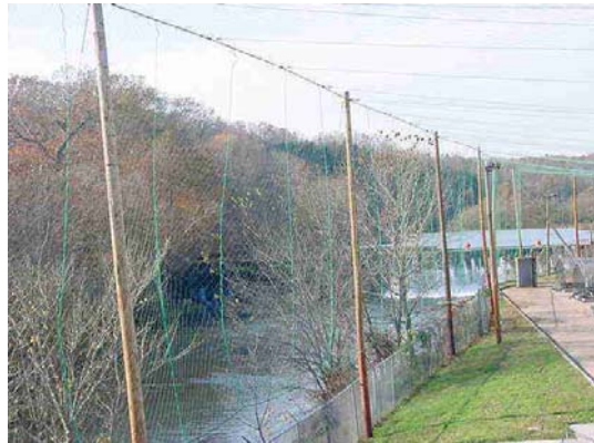
One more picture of what the net looked like up...a mess to clean up to say the least.