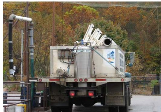
Trucks roll out rain or shine...

This quarter we trucked out 163,562 head of trout with a total weight of 102,731 pounds. Our driver's successfully and safely delivered these fish to designated sites all over the state. Our driver's also successfully backhauled 159,400 trout ranging in size from 5"-8" from the Norfolk and Greer's Ferry Facilities. So the next time you see Joe Haley, Jason Hickman, or Brandon Myers out stocking be sure to tell them what a good job their doing. The adjacent chart outlines the distribution numbers.