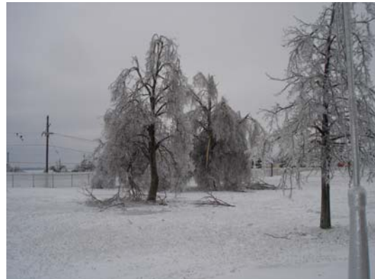
Trees prior to major de-limbing

The Donham Hatchery began its fish culture activities with the transfer of channel catfish yearlings to the Pot Shoals Net Pen Facility. The movement of these fish is necessary to make room for our spring production of other species. These fish were received as fingerlings from the Joe Hogan Hatchery and grown to a target size. Kelly Winningham, Fish Pathologist, performed a health assessment on the fish and after a clean bill of health was given, harvest operations began. The hatchery moved over 120,000