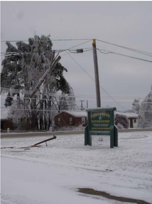
Main entrance to hatchery. Only utility pole left somewhat standing.

2009 at the Donham Hatchery, as well as much of northern Arkansas, started off with a bang. The “Ice Storm ‘09”, as it was dubbed by local media, hit with a fury and did substantial damage in the areas it covered, Donham hatchery being no exception. The hatchery received two inches of ice, in the form of freezing rain, by the time it was through, leaving the hatchery and residences without power for two weeks and making the grounds look like a war zone. Trees were stripped of limbs and power lines were on the ground in every direction. In Clay county alone 15,000 utility poles were down! To date crews are still in the process of getting things cleaned up. Now on to happier news...Fish Culture.